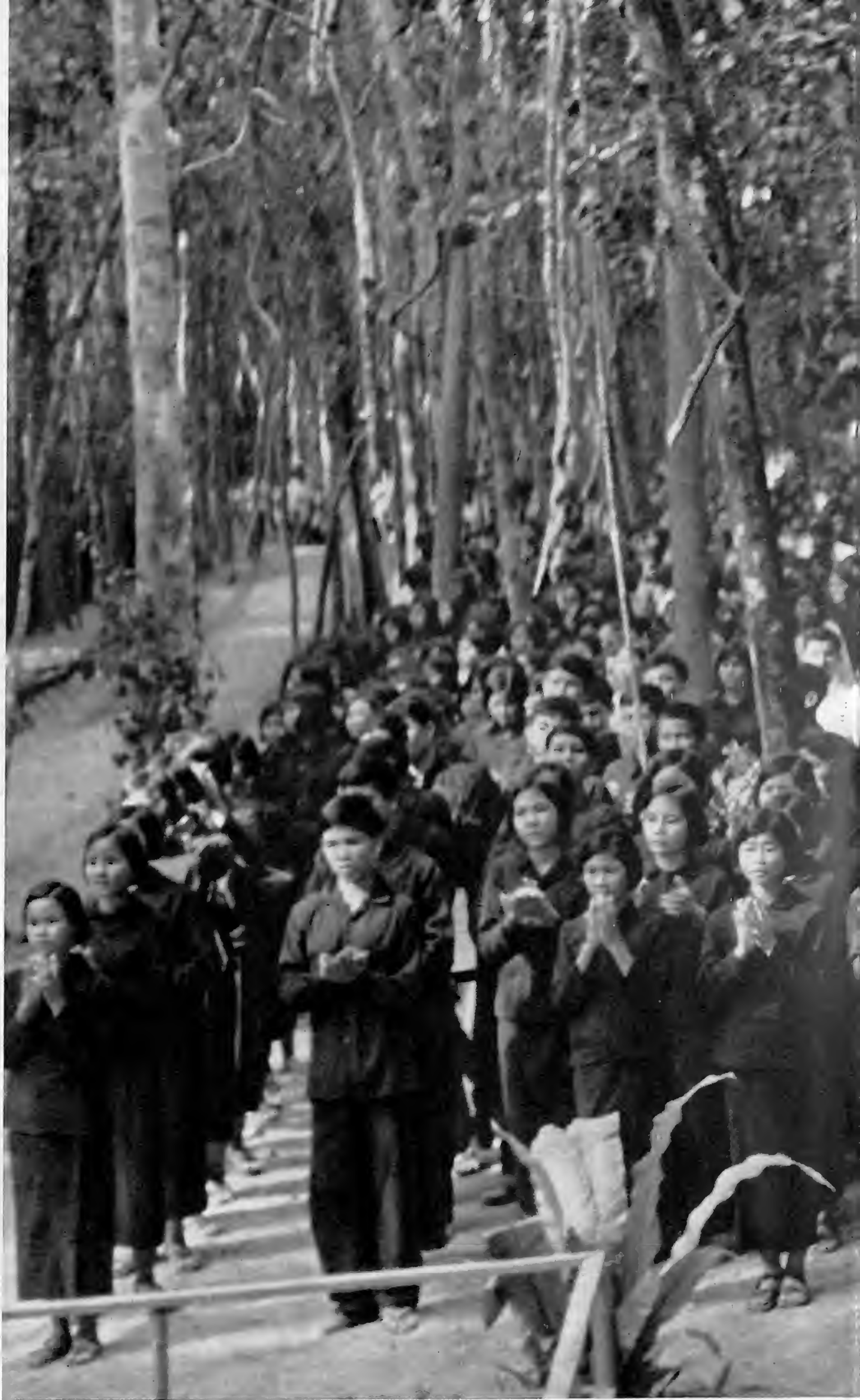
A rally of historic significance.